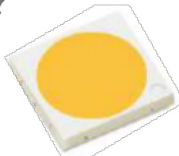
LUXEON 5050 160lm/W